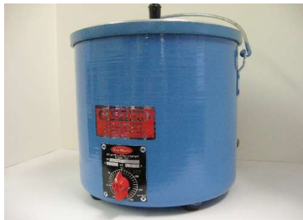
Bench Pot Type C75

Accurate, variable dial thermostats are used calibrated 250-550°F or 100-300°F as specified